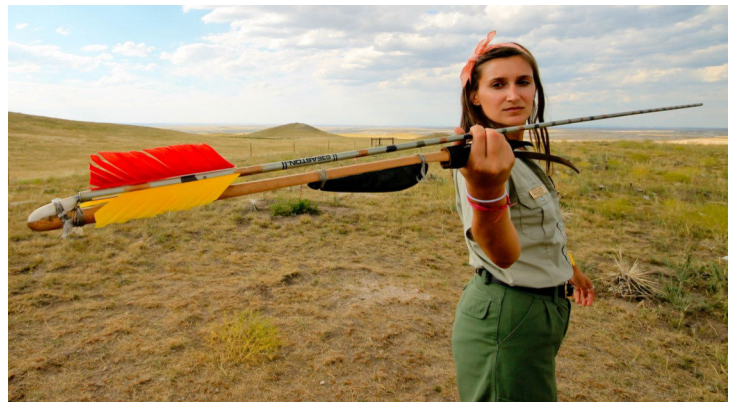
Photos from public programming at Hudson-Meng Education & Research Center.