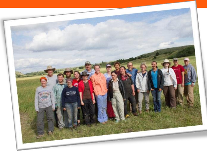
Joint Humphrey Site excavation crew from History Nebraska, University of Nebraska-Lincoln, University of Iowa and University of Oklahoma.