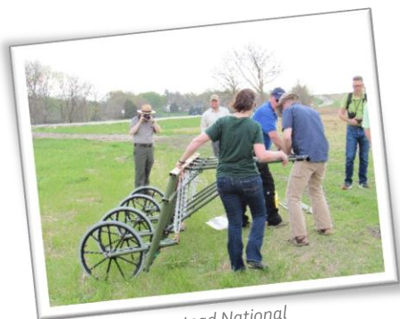
Homestead National Monument