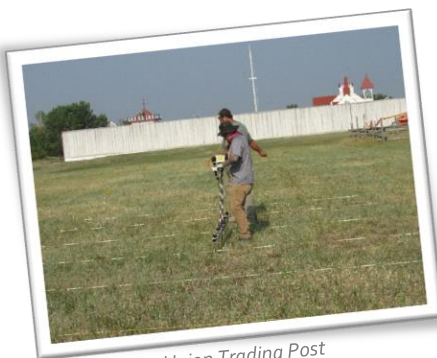
Fort Union Trading Post National Historic Site