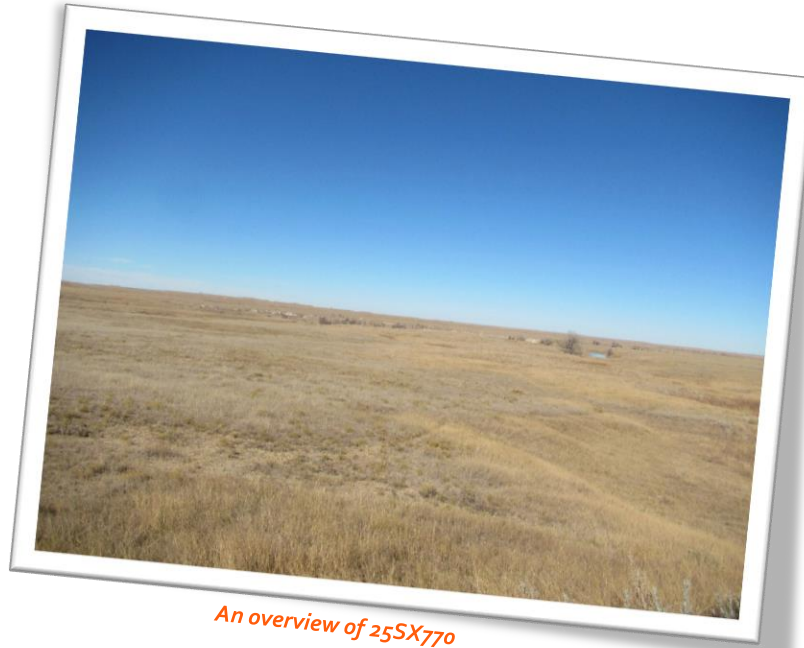
An overview of 25SX770

five from charcoal recovered from hearths and one from bone recovered in situ with lithic material. At this point, we have established at least four occupation periods. The first two date to approximately 480 and 660 14 C yr BP, respectively; both dates are based on hearth charcoal recovered from the surface or near-surface (30 cmbs). Samples from hearth fill yielded ages of 1176 ± 23 and 1458 ± 22 14 C yr BP, thereby establishing an approximate occupational timeframe. The charcoal samples were collected from depths ranging from ca. 60-90 cmbs. It is hoped that additional AMS samples can be submitted to obtain a second set of dates. The bone and lithics were recovered from a depth of