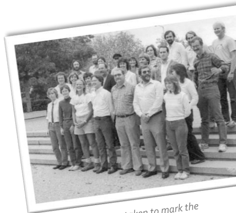
MWAC staff photo taken to mark the Center's 15 th anniversary in 1984

All events are free and open to the public. For events in the Denney Federal Building, visitors must have a valid photo ID and pass through a security screening area. Limited visitor parking is available on the ground floor of the Federal parking garage at the corner of N Street and Centennial Mall.